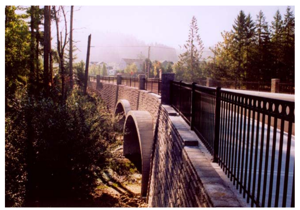
Figure 5: Finished Land Bridge

Even with the complex structural planning and site challenges that faced the project, the Progress Quarry Development turned out to be a huge success. With the beautiful AB Ashlar patterned walls, and AB Courtyard posts to accent the fencing, this functional site is a thing of beauty.