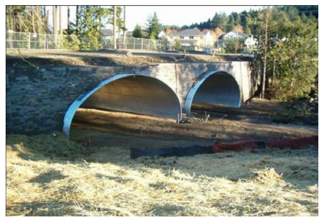
Figure 4: Bridge Wall Construction

During actual wall construction, the culverts designed were expected to flex as the land bridges were built around them. Each course needed to be placed