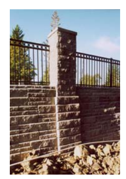
Figure 1: Pillar Block within the Wall Face

The original concept from the City of Beaverton included natural rock walls with a pillar or column feature to increase the aesthetics. With problems in the design concepts and initial estimates coming in way over budget, the general contractor started looking for different solutions for the project. He found Allan Block's AB Collection on the internet and contacted the local manufacturer for assistance. Central Oregon Block and Brick (COBB) worked with Allan Block Corporate and Columbia Machine to redesign the face of the block to create the pillared look desired by the City.