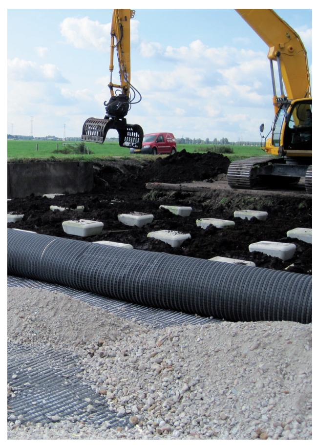
Geotextile reinforcement installed on piles (N 210; Netherlands)