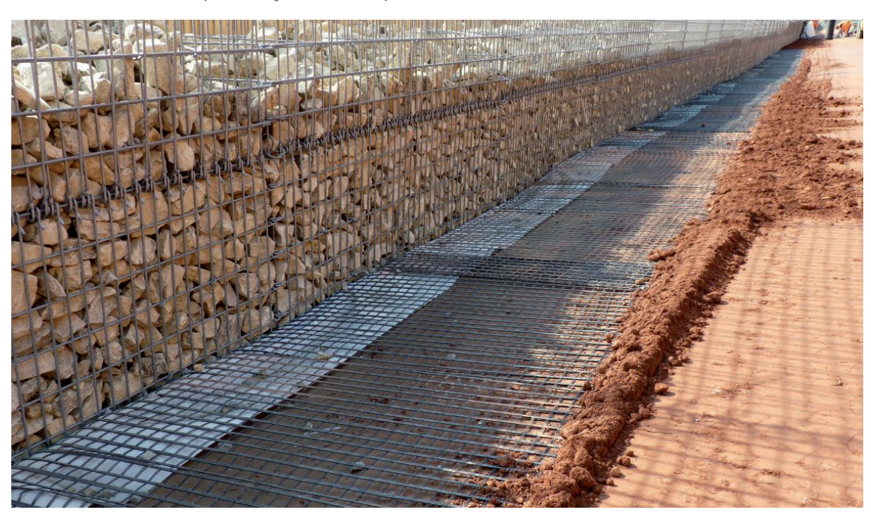
Tied-back gabion wall (A3 motorway near Haseltal, Germany)