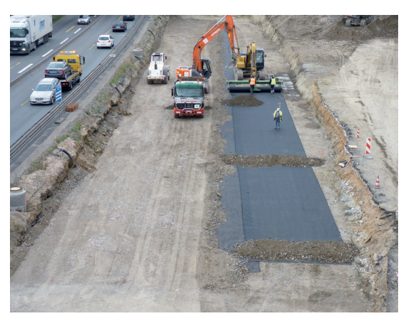
Bridging of sinkhole (Bochumer Westkreuz motorway interchange (A 52), Germany)