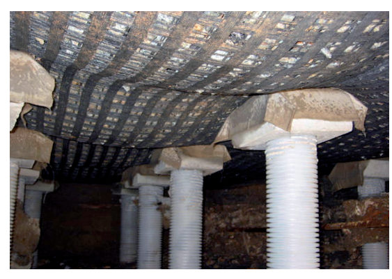
Membrane effect in piled embankment application (Railway Bidor-Rawang, Malaysia)